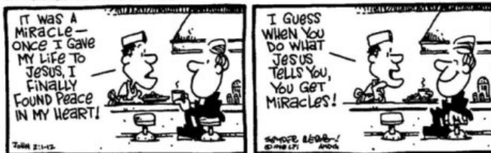
2 ND SUNDAY IN ORDINARY TIME

PARISH LIFE The next meeting Wednesday, February 12, 2025. We will discuss plans for 2025. Let's bring our Parish Families, Ministries, School and Friends together in community. Please contact the parish office 219-934-7176 to volunteer.